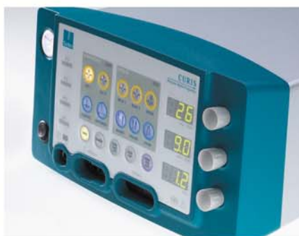
Figure 2: CURIS® radiofrequency unit (Sutter Medizintechnik GmbH)

Patients: The preoperative routine includes anamnestic questions, filling out a questionnaire by the patient (ESS,VAS) and a patient examination including flexible rhinopharyngoscopy. All patients undergo a cardiorespiratory polygraphy with the ApnaeGraph (MRA-Medical Ltd, Gloucestershire,UK). Besides the polygraphic parameters, the ApnaeGraph records the respiratory effort via two pressure sensors on a thin probe (2mm in diameter) which is introduced transnasally. It also records airflow via two temperature sensors. That way, an upper obstruction (uvula and above) can be differentiated from a lower obstruction (below the uvula). The exclusion criteria for RAPP are: \text{AHI} \geq 20 , \text{BMI} \geq 30 , tonsil size: \geq 3 (Friedmann table), modified Mallampati-classification [6] \geq 2 . If a patient has more than 40% of the obstructions on the lower level, the RAPP should not be performed because there is a high likelihood for failure.